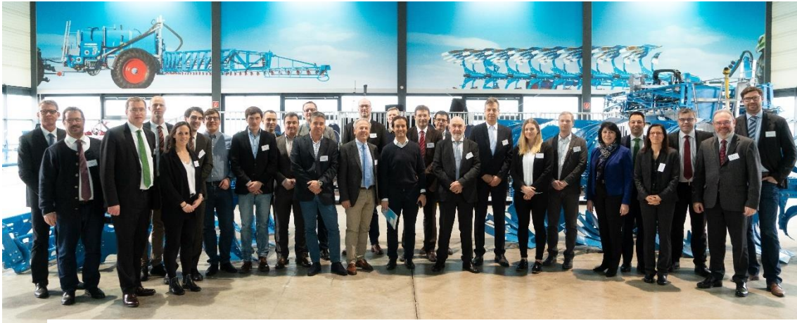
Members of the CEMA Product Groups "Arable Farming" at Lemken company headquarters